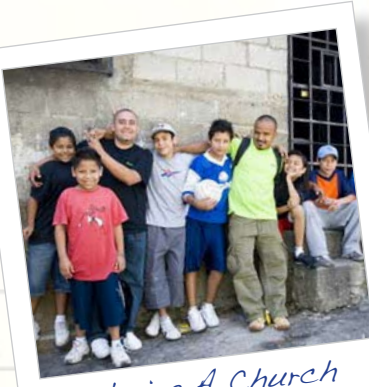
Exploring A Church Community

Each month parents, grandparents, aunts, neighbors (those responsible for sending students to school) attended "Parenting School" where they were encouraged and equipped to "train up their children in the way they should go"